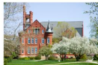
The Higdon Administration Building is surrounded by flowering trees in spring.