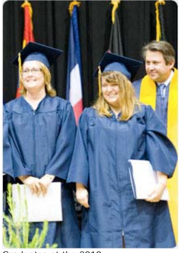
Graduates at the 2010 Commencement.