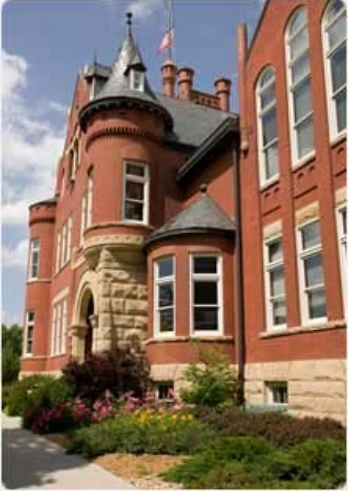
The Higdon Administration Building, the symbol of Graceland University, was built in 1897. Over the years it has housed classrooms, a library, science labs, a dining hall and administrative offices. It was renovated in 1998.