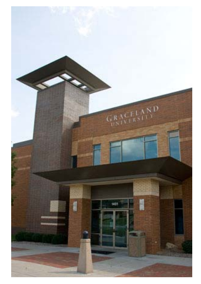
Front entrance of the Graceland University Independence Campus.

Semester Calendar Trimester Calendar Seminary Calendar