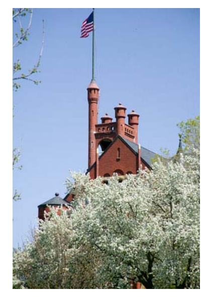
The Higdon Administration Building is surrounded by flowering fruit trees in the spring

Semester Calendar Trimester Calendar Seminary Calendar